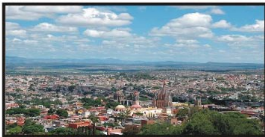
SKYLINE OF SAN MIGUEL DE ALLENDE